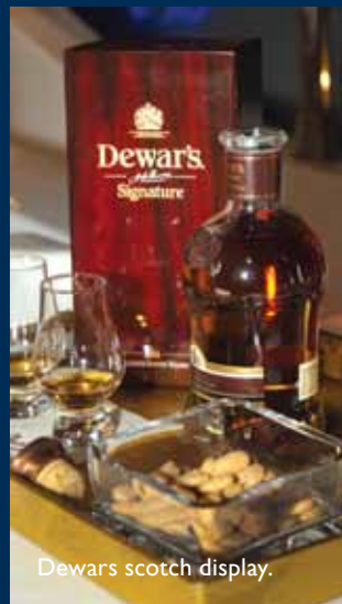
Dewars scotch display.