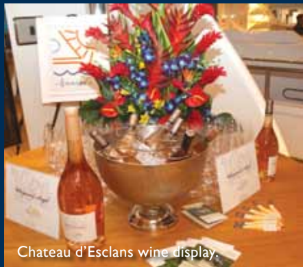
Chateau d'Esclans wine display.