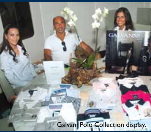
Galvanni Polo Collection display.