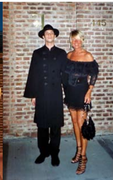
Faena Hotel entrance