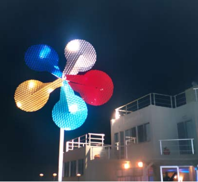
Eduardo Pla windmill sculpture at Le Club